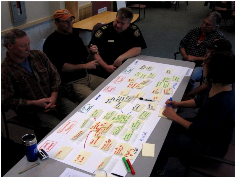
Picture 1. Impact Mapping in Castlegar, B.C. May, 2010

From the science, we then focus on areas of importance to the community. We define what is important to the community, for example, water availability, forest fire risk, municipal infrastructure and tourism. We then go through a mapping process in small groups with large pieces of paper, post-it notes and pens to visually map the potential environmental impacts of the science and what that means in terms of impacts to the community (see Picture 1.)